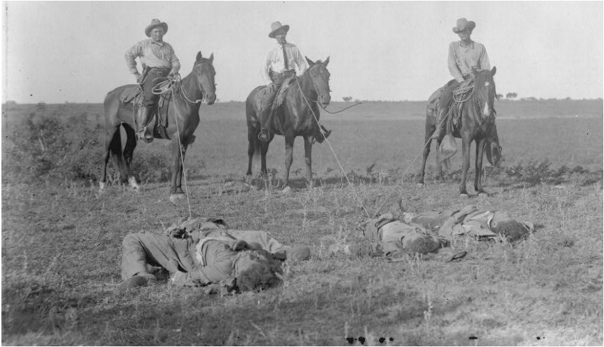
FIGURE 8.1. Texas Rangers with dead bandits, October 8, 1915. The famed Texas Rangers straddled more than the US-Mexico border. They also patrolled borders of race and ethnicity, protecting Anglo-American values from challenges by Hispanics, Indians, and African Americans. At no point did the challenge become greater than in the years of the Mexican Revolution, when the border became a very violent place. Their legacy as either gallant and fearless heroes or the tools of white supremacy continues to be contested today.

therefore turned to violence to solve the challenges posed by the presence of Indians and Tejanos in the republic/state.