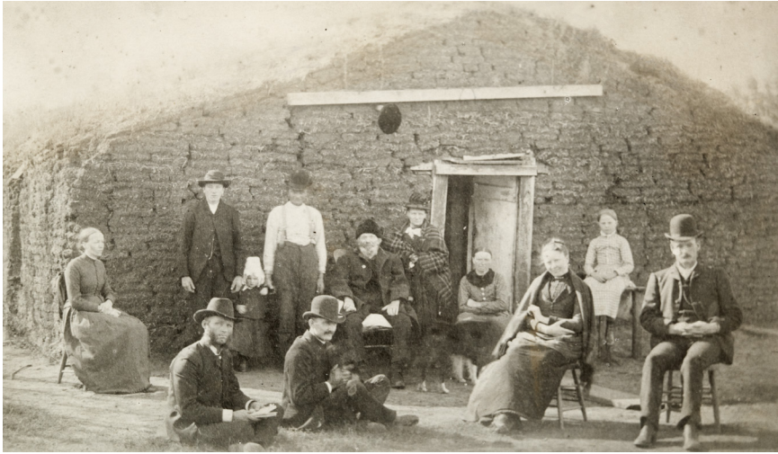
FIGURE 6.1. Attracted by climate and promises of cheap land, thousands of Northern European immigrants, like this group of Norwegian immigrants in front of a sod house near Madison, South Dakota, came to America for a better life. Railroads coveted and competed for these groups, believing their experience as farmers and their unquestionably white race made them ideal Americans.

of this population represented a massive and largely successful effort at social engineering.