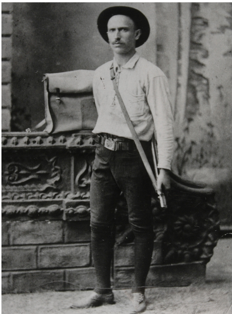
FIGURE 4.1. Studio Portrait of Lummis before His Tramp, 1884. Part publicity stunt and part a genuine effort to learn about his new home, Charles Fletcher Lummis walked from Chillicothe, Ohio, to Los Angeles, California. As he said, the trip enabled him to transcend from a “little, narrow, prejudiced, intolerant Yankee” into a westerner who appreciated Hispanic and American Indian cultures. These cultures helped make the West unique and superior in many ways to the East, he believed.