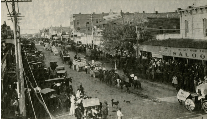
FIGURE 0.1. Settler's Day Parade, San Angelo, Texas. Parades like this celebrated the Anglo conquest of Texas. Former Texas Ranger and Confederate soldier John W. Long observed the 1910 version of this parade. Sharing his thoughts with the San Angelo Standard Times correspondent, he reflected, "I glory in the knowledge that West Texas will always be what we fought for and what the Lord intended it to be—a white man's country."

In 1910, a decade and a half after Lummis's pronouncement, residents of San Angelo, Texas, gathered to celebrate and lament the receding of Texas's heroic age. The parade of aged settlers marching down crowd-lined streets moved a correspondent for the San Angelo Standard Times to a paroxysm of nostalgia: "The old boys, a surviving remnant of the Old Guard, lined up today and with stride as nimble as that of youth and with step as elastic as that of boyhood's halcyon days, fell in line and proudly marched in grand parade." The paper continued, "The parade was in every way characteristic of the 'Wild and Woolly West.' To make the event all the more typical of early day[s,] pistol shots and cowboy yells rang out as the procession marched down Chadbourne Street." Behind the geriatric pioneers came the police, a military band, assorted ranchers and stockmen, and members of the Ku Klux Klan. 2 It was in every way the epitome of a small-town celebration.