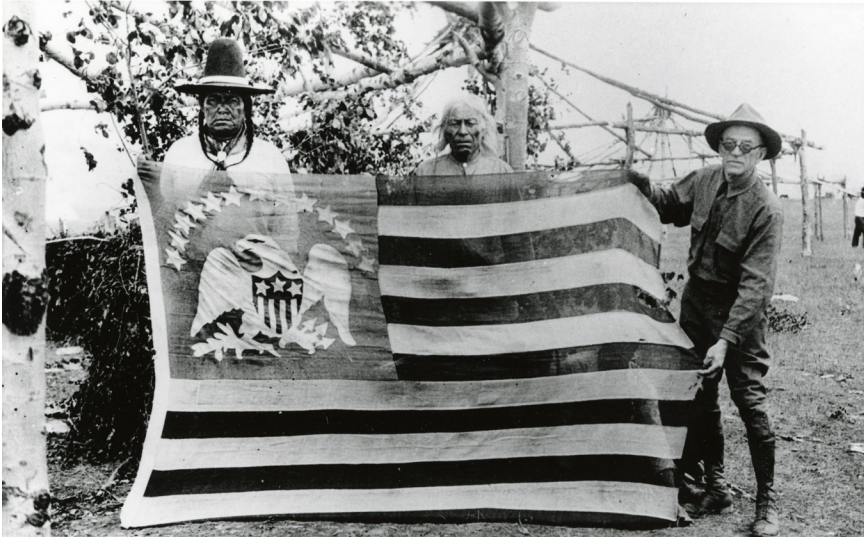
FIGURE 4.4. Frank Bird Linderman and two native men holding an American flag. Indian peoples represented “real Americans,” Frank Bird Linderman believed, deserving of rights and respect. Yet America, he professed, seemed on the edge of falling under the control of undesirable immigrants and the political machines they supported.

Plenty Coups, Chief of the Crows , while his biography of Pretty-shield, originally titled Red Mother , appeared in 1932. The two works marked the pinnacle of Linderman’s literary success. These aging figures were, to Linderman, authentic Indians who recalled the time before the white men came in numbers and dispossessed them of their lands. In comparison, Linderman wrote that younger Indians “know next to nothing about their people’s ancient ways.” In keeping with his belief in a vanished era he asserted, “The real Indians are gone.” 52