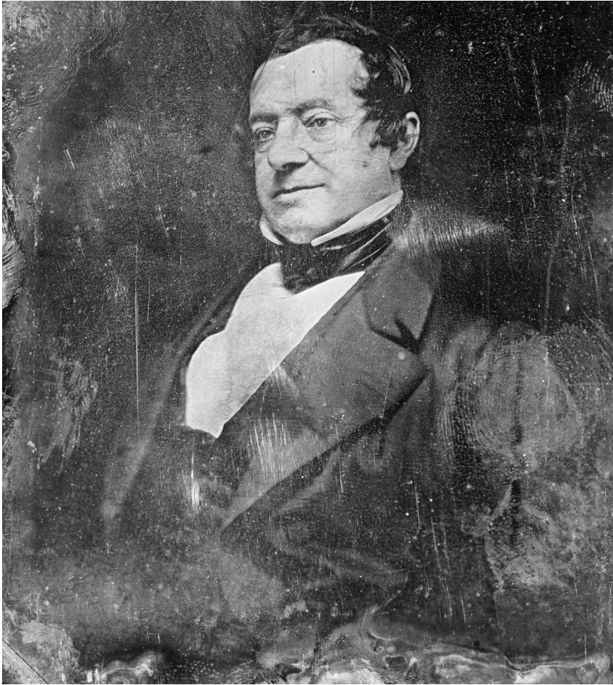
FIGURE 1.1. The writer Washington Irving, touring Indian Territory in the 1830s, warned that western expansion could lead to white racial decay. He worried that the vast spaces of the West could never truly be settled by Anglo-Americans and would instead be populated only by bloodthirsty Indians and outlaws. Within a decade, however, his uninhabitable plains would become the center of a continental nation.

the Arkansas River, a rope clenched in his teeth, while towing the rather effete writer in a makeshift raft), but Irving refused to see him as anything other than a “braggart and a liar of the first water.” 29 Applying his experience