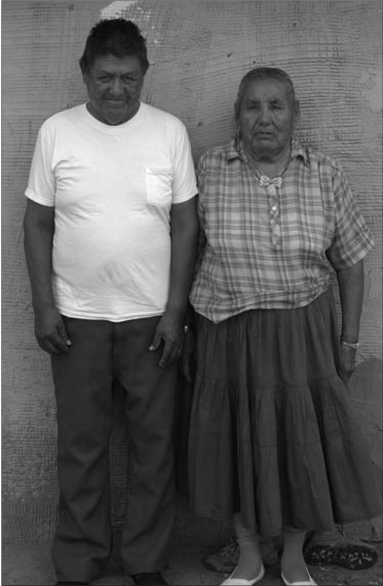
Photograph by Author, 2008