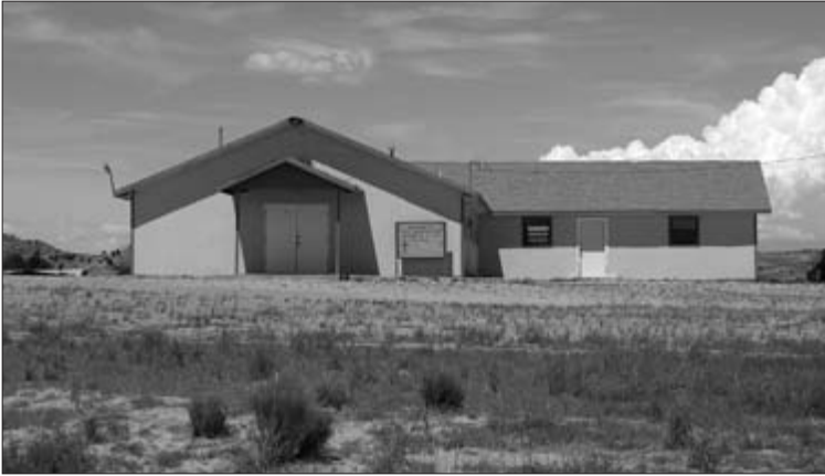
Photograph by Author, 2008